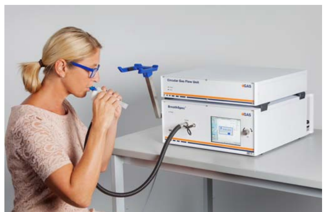
Figure 3: Handheld sampling option. Direct sampling of exhaled breath via by-pass on handheld, heated hose and sample introduction through pump.