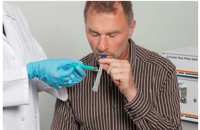
Figure 1: Manual sampling option: Exhaled breath is sampled into a reservoir (syringe) and afterwards manually injected into the device (figure 2).

Next to the dynamic breath the sampling of static volatiles is accessible using syringes: The analysis of volatile compounds in e.g. mouth or nose cavities may supply additional information.