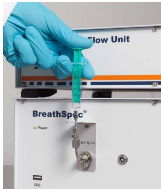
Figure 2: Sample injection into the Luer-port of the device.