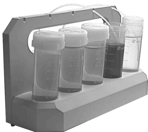
Rack for reagents bottles

With a special software, different spraying methods can be created, saved and loaded.